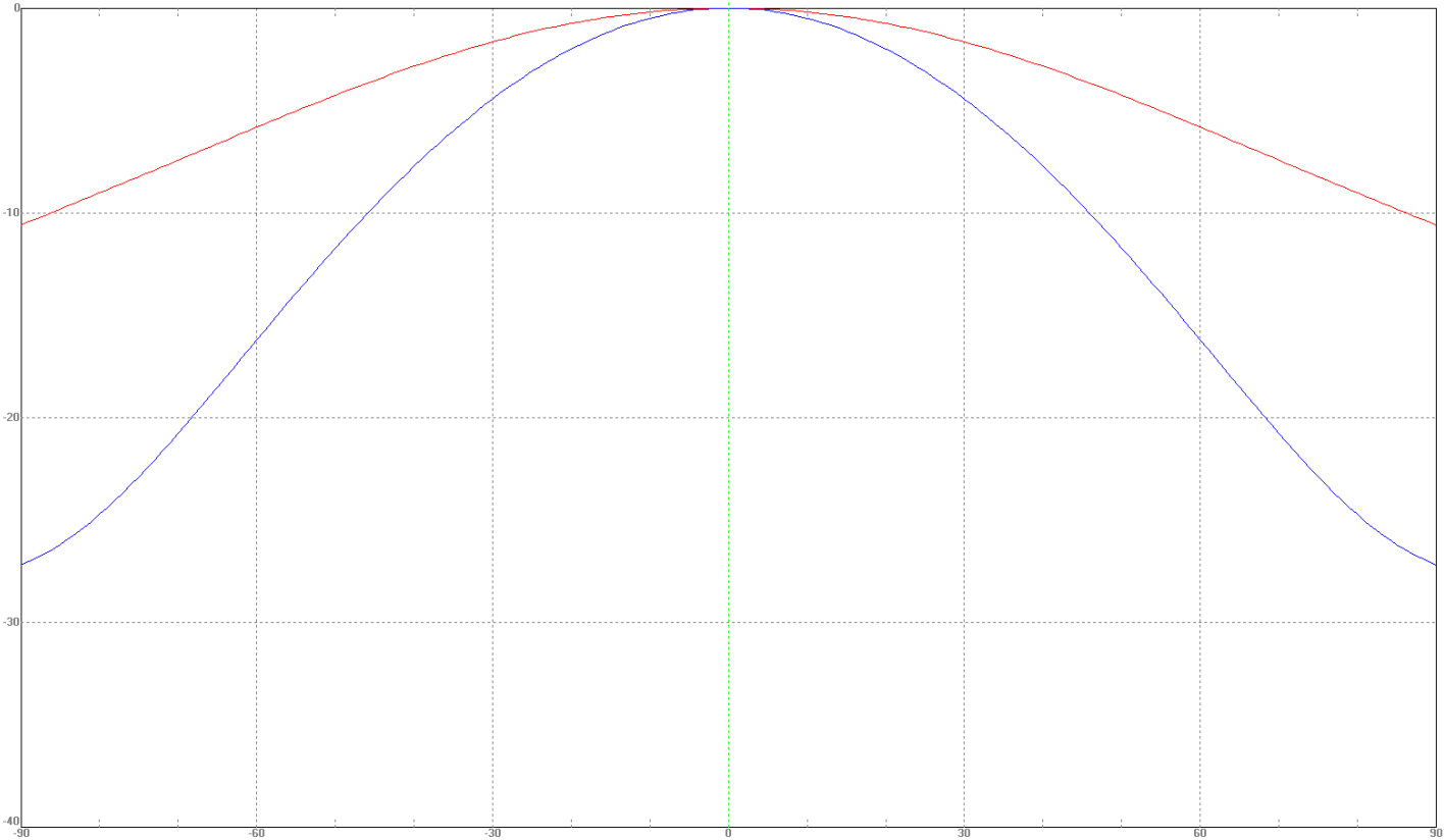
Beamwidth Pattern at 40 GHz